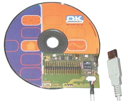
AT83C22OK/23OK Reference Design